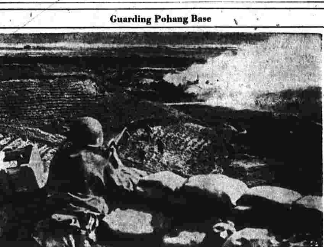
Guarding Pohang Base... An American soldier keeps watch from a fortified ridge overlooking a burning village in the Pohang area of the Korean front...