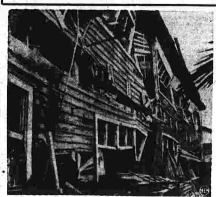
Mile and a half away: This wood-frame building, 8,000 feet from point of blast at Nagasaki, was badly ruptured. Maximum distance for property damage would be about five miles.

The atomic bomb is a frightening weapon. A lot of frightening words have been written about it. Is there any hope of surviving its deadly blast? The Atomic Energy Commission believes there is, and explains why in a book just issued, "The Effects of Atomic Weapons," which represents the latest official thinking on an awesome subject. Here's the first of four reports, based on that book, which attempt to explain what and what not to expect from the bomb, and how you and your family can help protect yourselves from it.